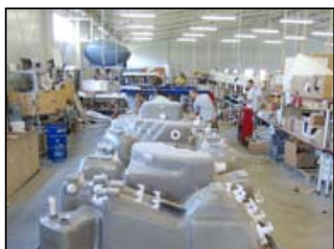
SPA PRODUCT LINE