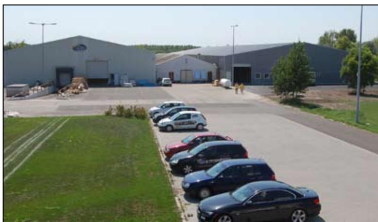
PRODUCTION PLANT OF 7000 m 2

We want to thank all the people internationally for choosing WELLIS products, and we hope that we can soon be part of your everyday life too!