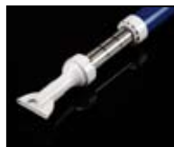
Floor cleaner nozzle

No hoses or electricity required, just a simple gentle action is all it takes for a sparkling clean spa. It comes complete with a comprehensive set of accessories to make cleaning your spa a breeze.