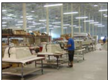
BATHTUB PRODUCT LINE

We are a European company dealing in Euros, so no more pricing fluctuations from volatile currency exchange rates