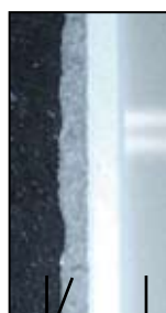
PU foam reinforcement in several layers 5/4 mm thick acrylic layer

We have developed what has traditionally been an industry dominated by manual production using hand held tools to another level - producing products built with manufacturing tolerances of less than one tenth of a millimetre. Automation has led to other innovations in design as well. We utilize robotics for our unique polyurethane diffusion and cutting technology, accurately ensuring the precise thickness of each bathtub and spa body.